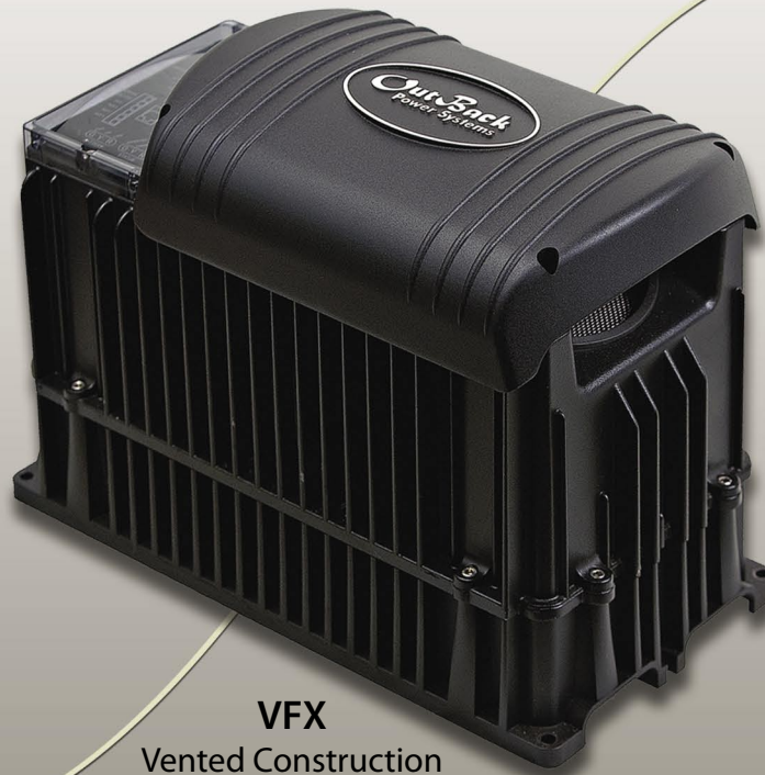
VFX Vented Construction